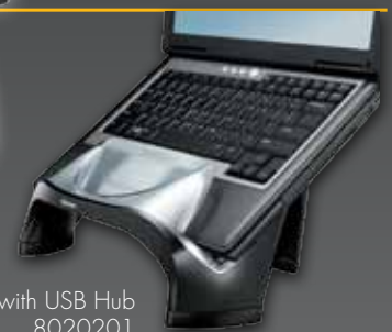
Smart Suites™ Laptop Riser with USB Hub 8020201