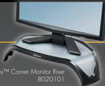
Smart Suites™ Corner Monitor Riser 8020101